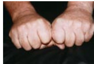
Fig 3. Preservation of the metacarpal arch and motion of the ulnar side of the hand in case 1.

One or two 2.7mm cortical lag screws are placed just distal to the CMC joint to fix the fifth to the fourth metacarpal. (Fig 5,6 and 7). Fluoroscopy is used to confirm the position of the fixation. 10-11 Autogenous cancellous bone graft is added. The dorsal periosteal/capsular flap is sutured to the volar joint capsule to act as an interposition graft between the fifth metacarpal and the hamate.