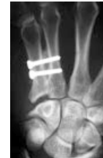
Fig 4. Postoperative radiograph of case 1.

Both patients were satisfied and had a good cosmetic appearance without malalignment, malrotation or shortening of the fifth ray. The fifth metacarpal was stable and the transverse metacarpal arch preserved. There was flexion/extension on the ulnar side of the hand through the fourth CMC joint (Fig 4). Range of motion at the wrist was full and pain-free. Radiographs confirmed union between the fourth and fifth metacarpal bases (Fig 5). There were no infections or neurological complications.