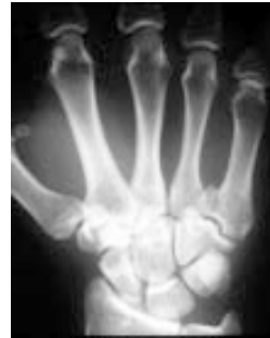
Fig 2. Pre-operative radiograph of case 2.

The articular facets of the fourth to fifth metacarpal joint are excised to subchondral bone (Fig 3). The bases of the fourth and fifth metacarpals are held with a bone holding clamp and care is taken to ensure a satisfactory rotation, alignment and length of the fifth metacarpal (Fig 4).